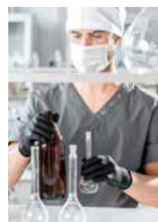
ANTI CANCER AGENTS